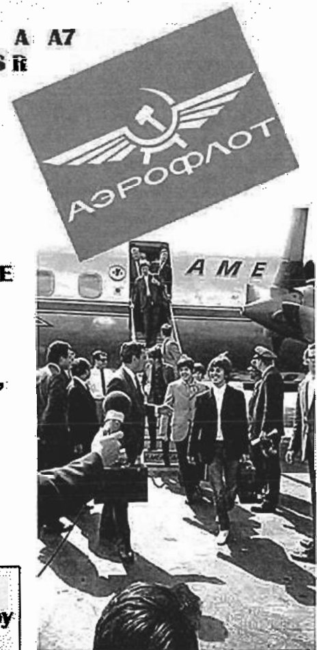
The Beatles are greeted by the press while exiting airplane in Washington D.C. during 1966 American tour

A A A Oo-Ooo-Ooo-Oooo, Oo-Ooo-Ooo-Oooo, Oo-Ooo-Ooo-Oooo