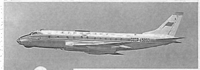
July 15th, 1968: Commercial air travel begins between the US and the USSR

A D C D Flew in from Miami Beach B.O.A.C., Didn't get to bed last night