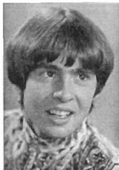
Davy Jones RIP 1945-2012

At the start, the four actors provided vocals for the songs played during the television episodes and released as records (supervised by legendary producer Don Kirshner), but were otherwise given extremely limited performance opportunities.