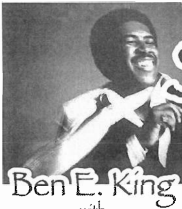
Ben E. King with Jerry Leiber & Mike Stoller 1960

Jerry Leiber (b. 1933) and Mike Stoller (b. 1933) are among the most influential American songwriters and music producers of popular music. In the 1950s they created a string of hits that include "Hound Dog", "Kansas City", "Smookey Joe's Cafe", "Riot in Cell Block #9", and "Jailhouse Rock."