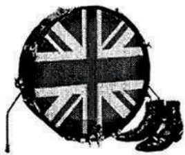
Ukulele Club of Santa Cruz The British Invasion January 2006