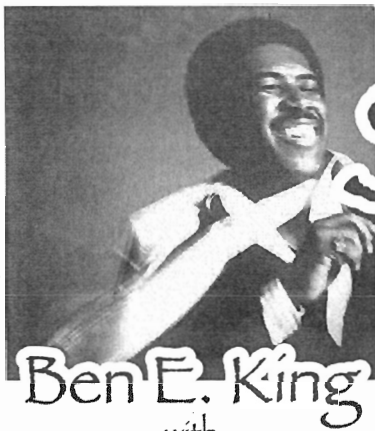
Ben E. King