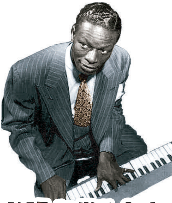
NAT KING COLE 1919-1965