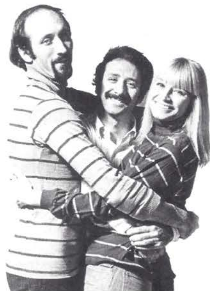
Peter, Paul & Mary