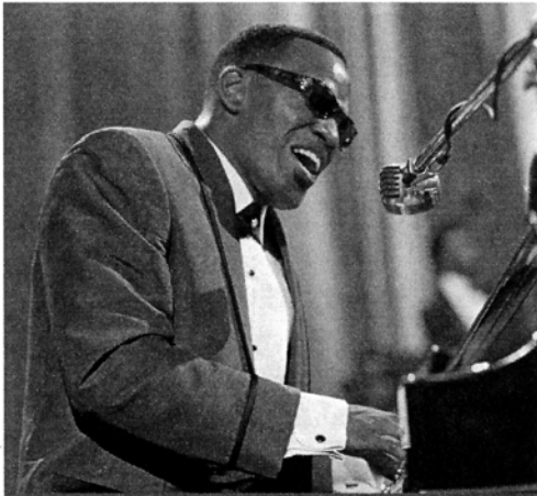
Written by Percy Mayfield, this song became famous after it was recorded in 1961 by Ray Charles and Raelettes vocalist Margie Hendricks.

Am G F E7 Am G F E7 Hit the road, Jack, don't you come back no more, no more, no more, no more, Am G F E7 Am G F E7 Hit the road, Jack and don't you come back no more. (what you say!)