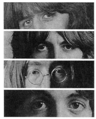
This song first appeared in 1965 on the Beatle's UK album Help! and on Beatles VI in the U.S.