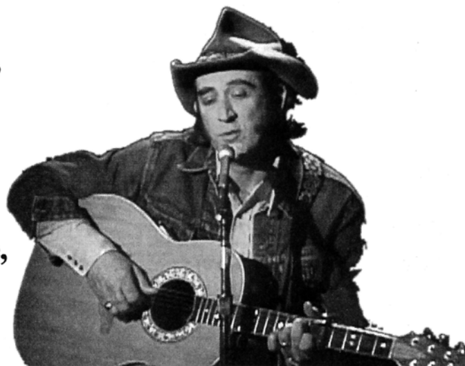
Recorded by country music artist Don Williams in 1978, "Tulsa Time" became his eighth #1 hit.

Repeat last 4 lines, then tag last 3 lines (change to G7 on "know")